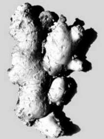
Fictional packaging design

Sans or FF Market. The typeface is also a fine fit for children's books and comics, festive occasions, as well as for sports, DIY or stationary and crafts.