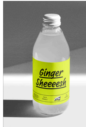
Supermarker Medium + Light Italic

The authentic appearance, intelligent technology and six styles (along with italics) make Supermarker the perfect choice for offer signs, packaging, brochures, leaflets, advertisements and advertising posters. It's a fresh, modern alternative to classics such as Comic